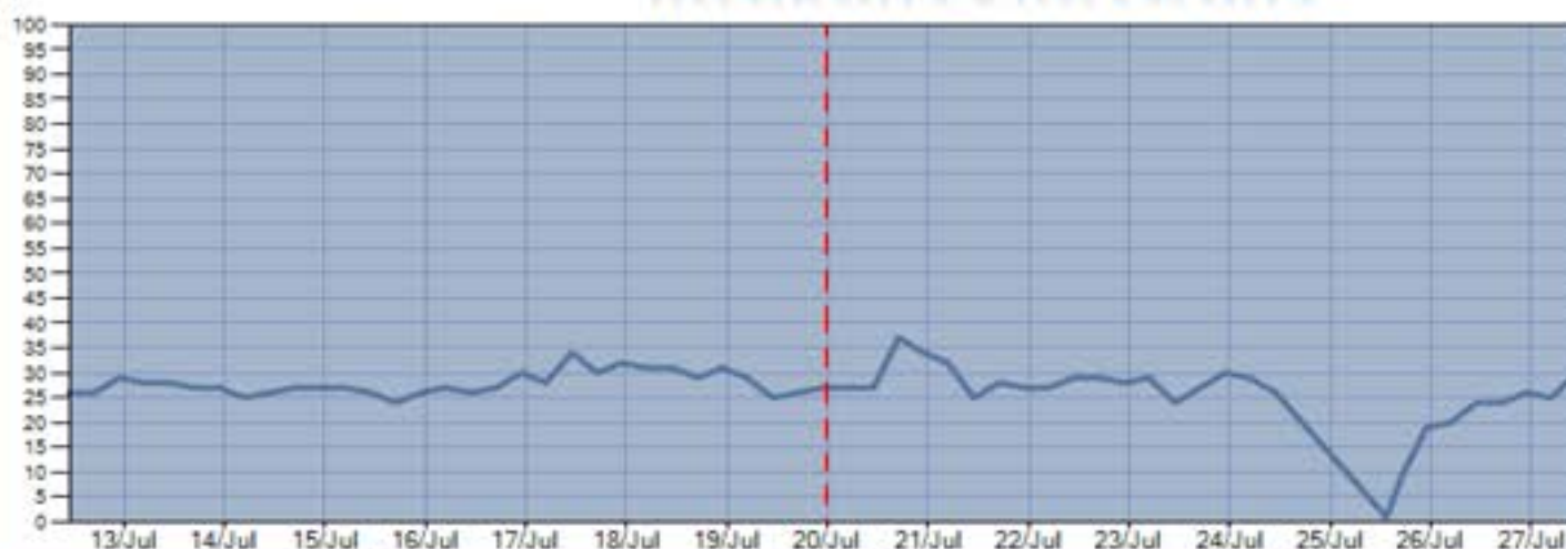
Score Card 07/20/2012 - 07/27/2012

Access your well status from anywhere with an internet connection.